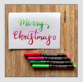
Step 7 Leave to dry.